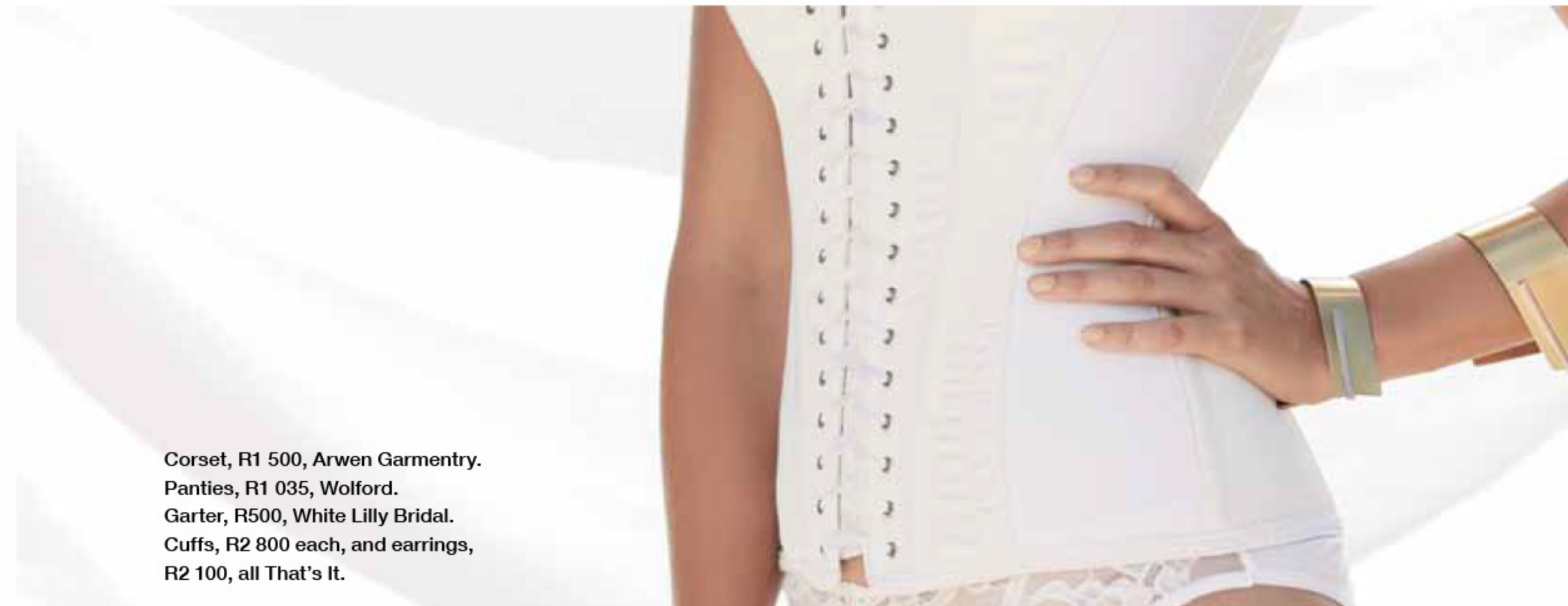
Corset, R1 500, Arwen Garmentry. Panties, R1 035, Wolford. Garter, R500, White Lilly Bridal. Cuffs, R2 800 each, and earrings, R2 100, all That's It.